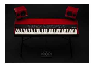
Nord Grand with optional Nord Piano Monitors for optimal near-field listening.