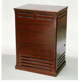
The Nord Electro 6 series includes the same Rotary Speaker simulation of a vintage 122 unit as the Nord C2D.

The Farfisa* and Vox* simulations capture the behavior and unique response of the original vintage classics. The Nord Electro 6D 61 and 73 features physical drawbars and can accomodate the Nord Half-Moon Switch (optional accessory).