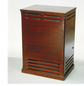
Vintage 122 unit

There are three modes - Stop, Slow and Fast mode that can be controlled either with the onboard panel buttons, an optional foot pedal or the Nord Half-Moon Switch (accessory). Naturally, the Nord C2D can also be connected to an external rotary speaker cabinet using the 11-pin Leslie* high voltage output or the high level ¼" jack output.